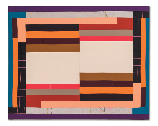
Above: Paolo Arao / Aubergine Queen , 2020 / Sewn cotton, canvas, nylon, hand woven fibers, corduroy, and denim / Courtesy of the artist

PA: For quite some time, I had been thinking about ways to acknowledge my heritage in a way that felt genuine to my work. I began reading about Indigenous textiles from the Philippines and felt a strong connection to this tradition—a